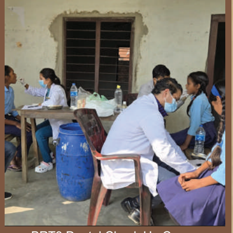
BRT3 Dental Check Up Camp