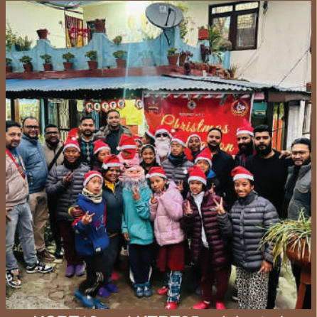
KCRT12 and KTRT25 celebrated Christmas with children