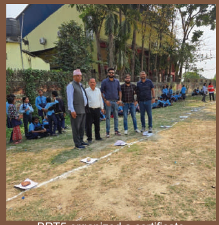
BRT5 organized a certificate distribution program