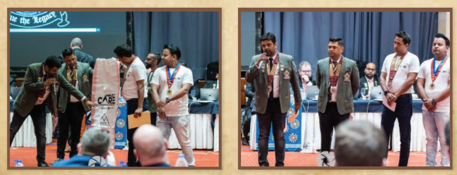
Project Care presented in HYM Cyprus

As one of the world's most iconic and sought-after peaks, Mount Everest attracts thousands of climbers each year, leading to a significant accumulation of waste. In collaboration with the Sagarmatha Protection and Conservation Committee (SPCC), we are working to remove 20,000 kilograms of waste from the Everest Region and transport it to Kathmandu for recycling and proper disposal