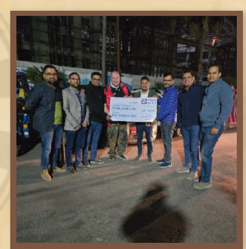
BSRT18-CSR Fund Cheque Handover