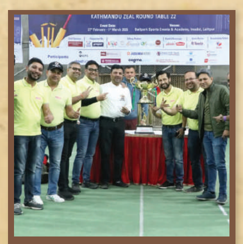
KZRT22- Indoor Corporate Cricket Tournament