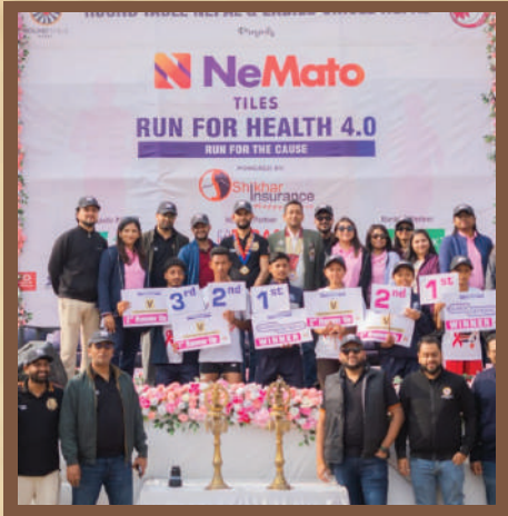
BPRT11-Run for Health 4.0