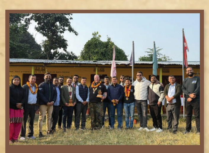
DRT26 Inaugration of Pashupati Shiksha Mandir

As a testament to RTN's commitment, the RTI President personally traveled across Nepal to inaugurate five newly developed Model Schools. His presence highlighted the importance of investing in education and showcased the impact of collaborative efforts between RTN, communities, and stakeholders. These schools now stand as symbols of progress, giving students the opportunity to learn and grow in an improved academic environment.