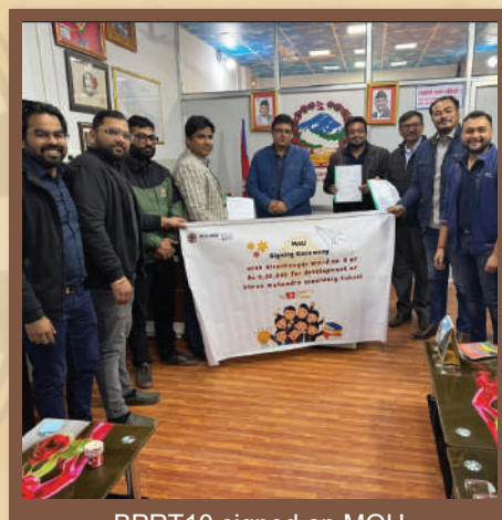
BPRT10 signed an MOU