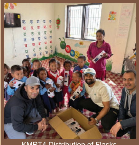
KMRT4 Distribution of Flasks, Sports Equipment's