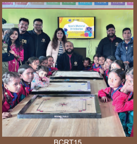
BCRT15 Sports Material Distribution