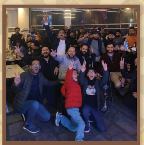
KURT17-Champions Trophy Finals 2025 India VS NZ