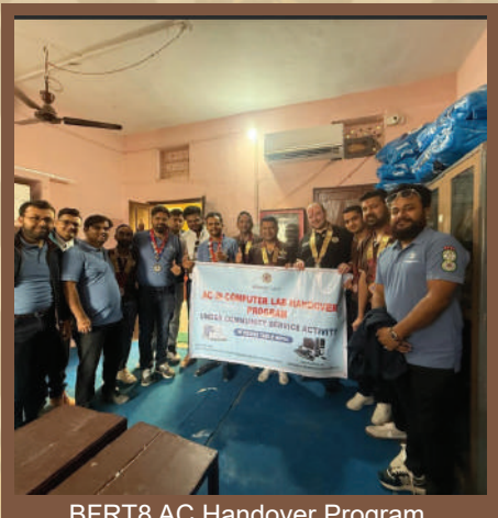
BFRT8 AC Handover Program