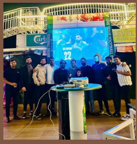
DRT26-Live Secreening India VS NZ