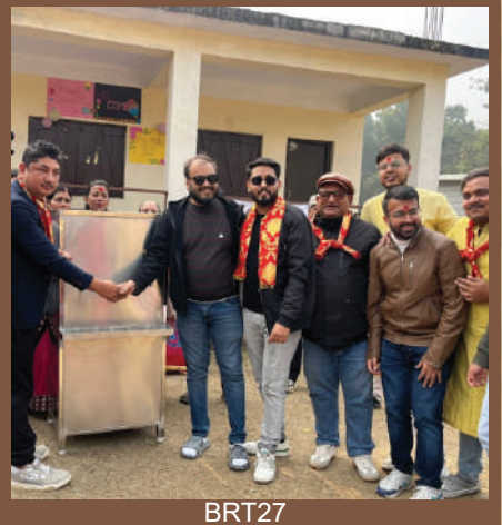
Donated a water filter