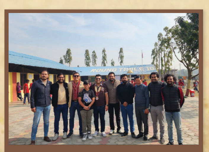
BPRT10 inauguration of Shree Adharbhut Vidyalaya as Model School