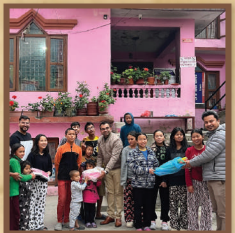
KERT2 Holi Colors and Sweets Distribution Program